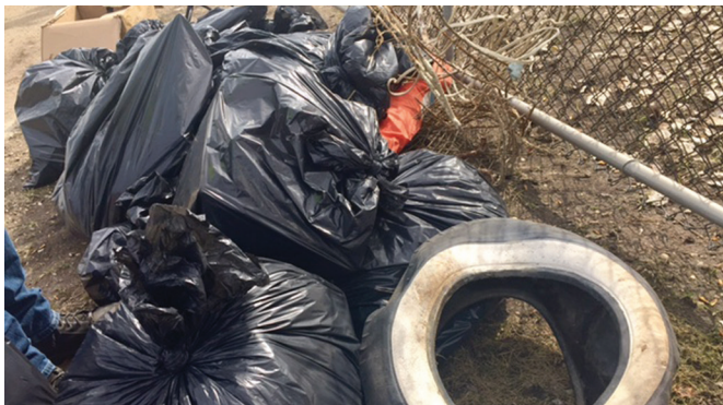
Some of the trash collected from the Rosssdale Water Treatment Plant and surrounding river valley in May 2019.

EPCOR has been a proud supporter of the Capital City Clean-Up program for the past 14 years. In May, we participated in some serious spring cleaning around the water treatment plant and Rosssdale community.