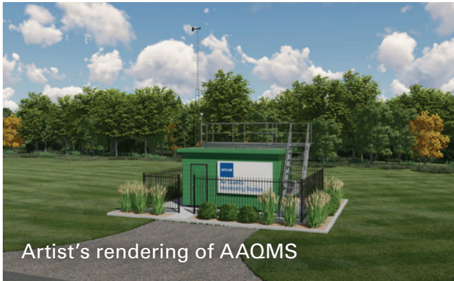
Artist's rendering of AAQMS