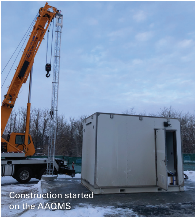
Construction started on the AAQMS