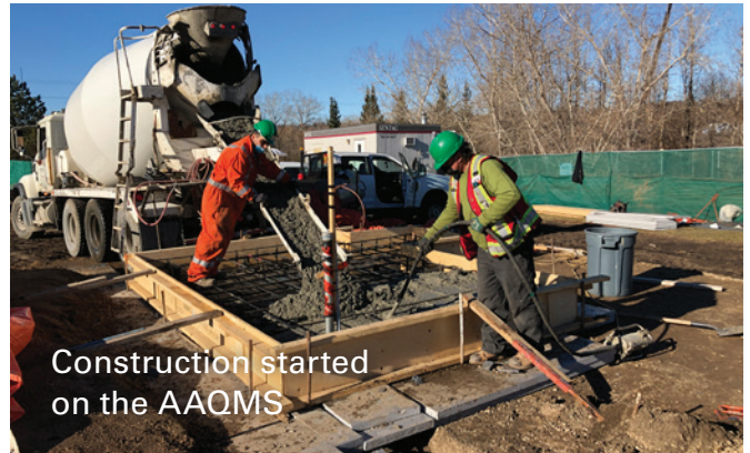
Construction started on the AAQMS