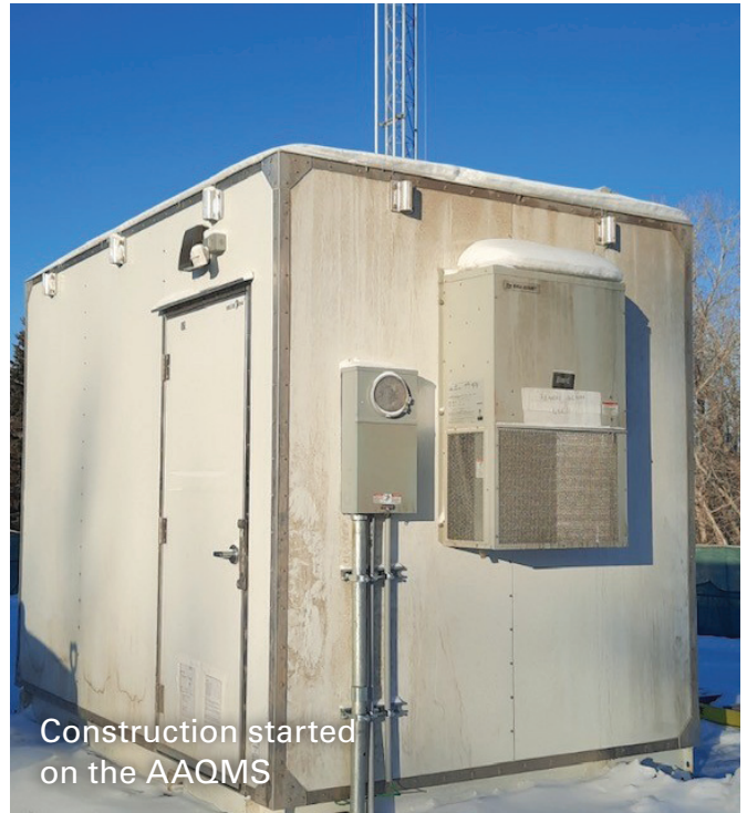
Construction started on the AAQMS