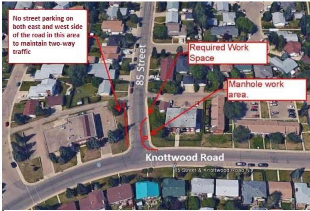
Working area 2 layout plan

If you have questions about this project, please contact: