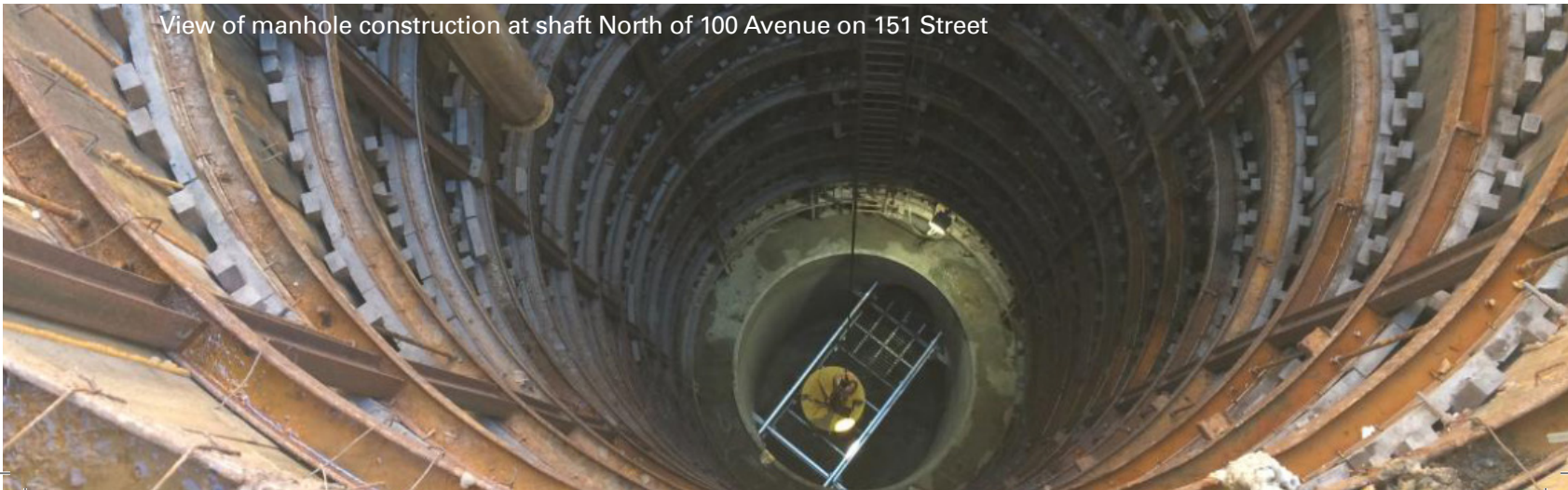
View of manhole construction at shaft North of 100 Avenue on 151 Street

Flows to the new bypass tunnel have now been fully diverted, work in the shaft at 151 Street and 99 Avenue has now resumed. This will involve uncapping of the shaft and rehabilitation of the existing sewer along 151 Street. This work is expected to carry over into the middle of the first quarter of 2018.