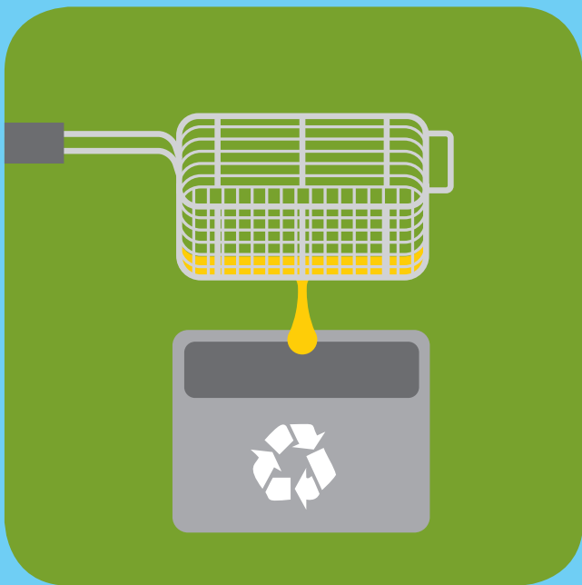
STORE YOUR USED FRYER GREASE (AND THEN RECYCLE)