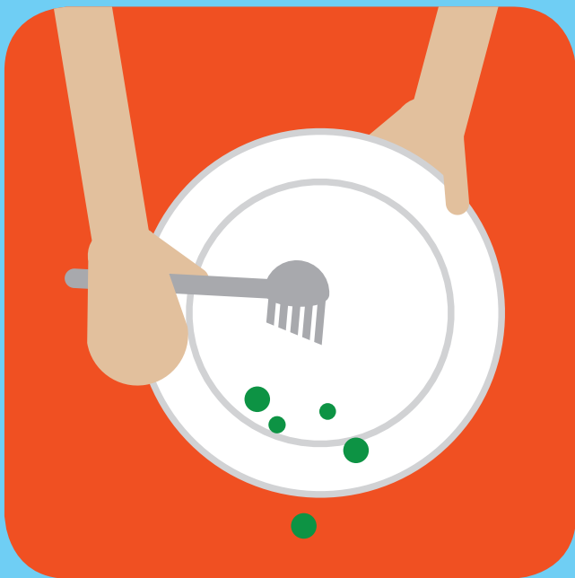
CLEAN YOUR DISHES BEFORE WASHING

Remember that Fats, Oils and Grease (FOGs) can cause problems for your business and for the municipal wastewater collection system. Follow these simple instructions to eliminate FOGs from building up in your pipes.