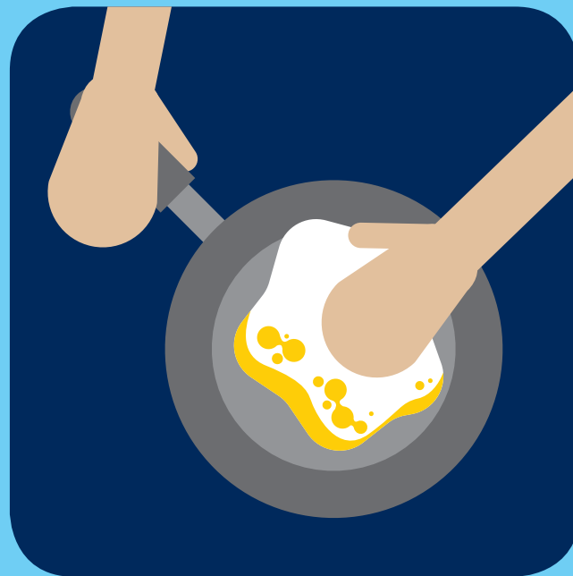
WIPE FOG FROM POTS AND PANS