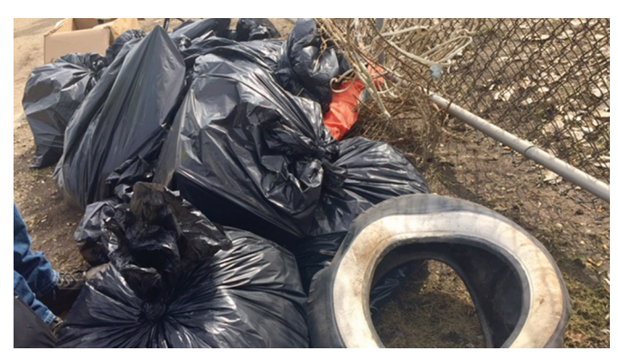
Some of the trash collected from the Rossdale Water Treatment Plant and surrounding river valley in May 2019.

EPCOR has been a proud supporter of the Capital City Clean-Up program for the past 14 years. In May, we participated in some serious spring cleaning around the water treatment plant and Rossdale community.