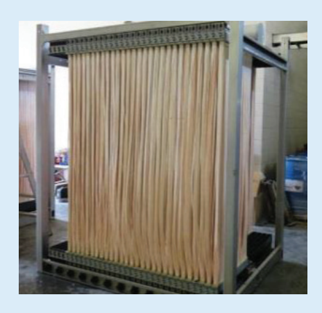
Membrane technology that would be inserted into existing tanks.