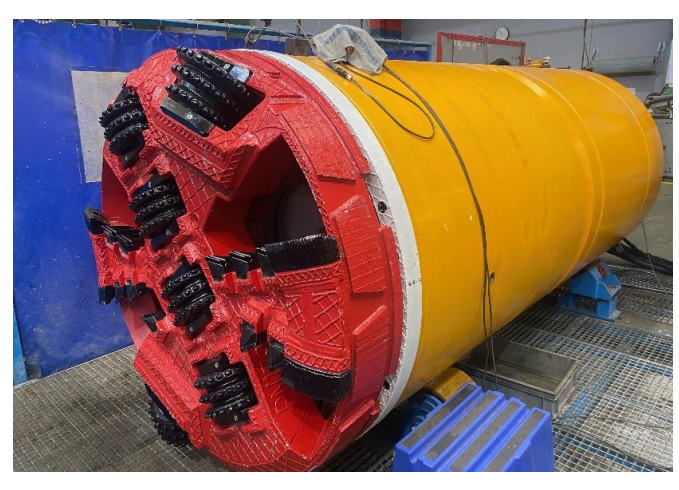
Tunneling Boring Machine (TBM)

In some situations, 24-hours-a-day, 7-days-a-week (24/7) tunneling work is required to reduce the risk of the TBM becoming stuck underground. Residents and businesses in the area of the work will be notified before this activity begins.